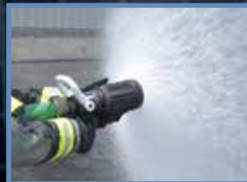
Full NFPA Fog