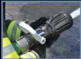
True Smooth Bore