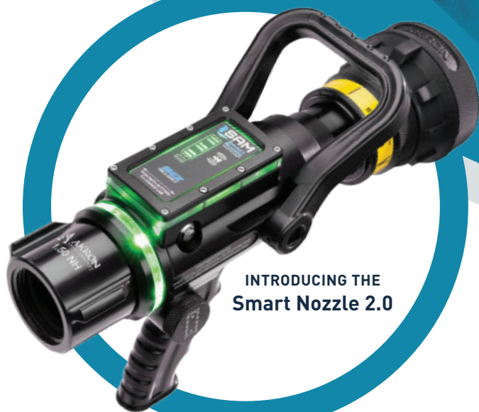
INTRODUCING THE Smart Nozzle 2.0