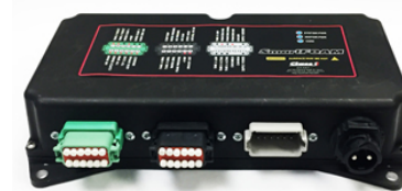
New Smart Motor Driver upgrade kit

Single Tank Dual Tank 550-00020-001 550-00024-001 550-00020-002 550-00024-002 550-00020-003 550-00024-003 550-00020-004 550-00024-004