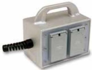
Junction Box ready for Direct Wiring