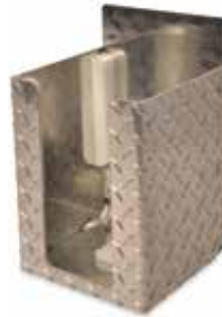
EJBX-VMT-TP Aluminum treadplate vertical mounting bracket