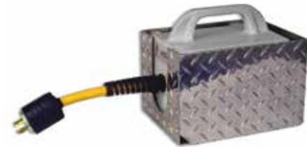
EJBV-HMT-TP Aluminum treadplate horizontal mounting bracket