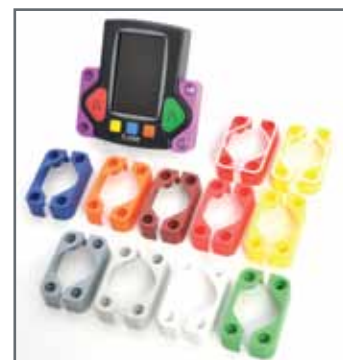
Optional color indicators available in standard NFPA 1901 specified colors. Available on Styles 9323 and 9325.