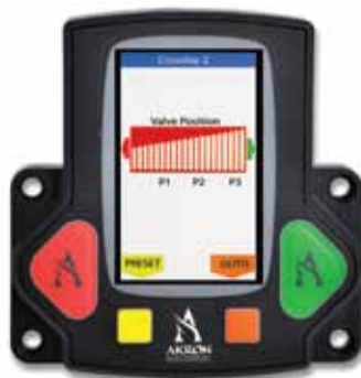
Also available as a valve controller only Style 9323