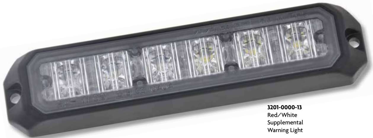
3201-0000-13 Red/White Supplemental Warning Light